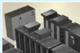
Liebert XD™ Cooling